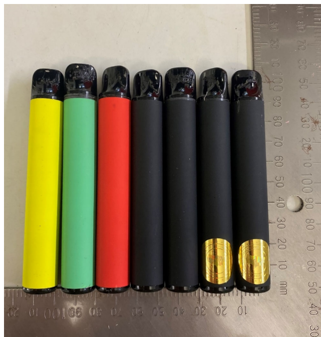
FIGURE 1 The seven unlabelled disposable vape samples volunteered for analysis (from left to right: samples 1–7).

The service user was a 45-year-old white male in full-time employment and living in privately owned accommodation. All samples were purchased illicitly from the same UK-based supplier who was purportedly sourcing the products from the United States. They were initially sold as 'THC-based products'; however, the supplier later provided a certificate of analysis (COA) which reported the contents as a mixture